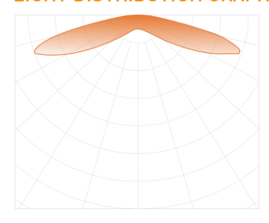
Beam angle: 160°